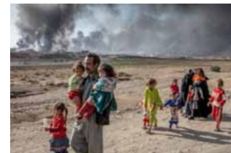
Civilians leaving Mosul

Thus, the humanitarian component in Syria proves that Russia was and remains the state with responsible approach to solving the crisis in the country. Thanks to the efforts of Russian diplomats and military personnel, humanitarian aid, including that from the UN, reached all Syrian settlements.