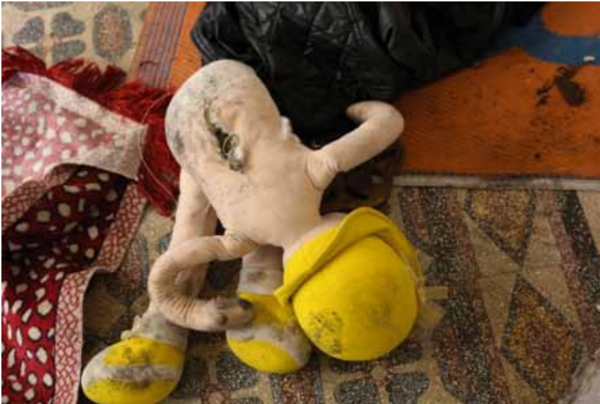
Trip-wire mines disguised as children's toys.