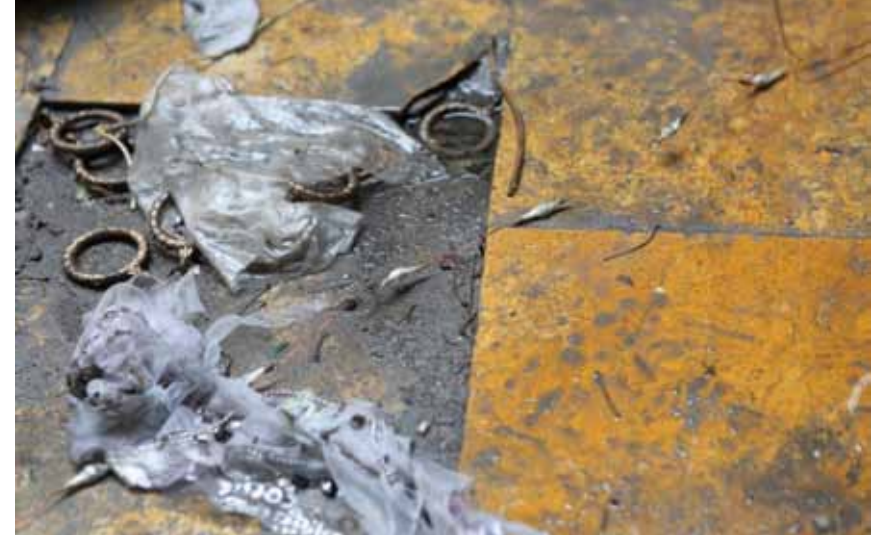
“Garland” – pressure-activated contact wire (laid out on the floor under rubbish or carpets)