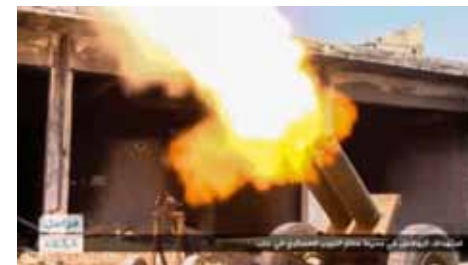
“Hellfire” mount

The major Western TV channels – BBC (UK), CNN (USA), France 24 (France) – were virtually all day long showing the stories devoted to Aleppo. The consequences of the battles were the main topic for the ‘talking heads’. Obligatory for demonstration were the city ruins along with killed and wounded civilians, but nobody mentioned that the most of the destruction and casualties were caused by terrorists, who fired from improvised “hellfire” mounts.