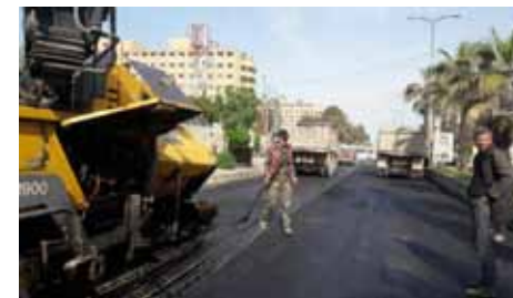
Reconstruction works in Aleppo

As for Mosul, by May 16, 2017, according to a coalition spokesman, there were no more than 12 square kilometers in the city still under control of the DAESH. However, considering the incoming information, the violence there is unlikely to stop. The city liberators turned out to be not better than the terrorists. According to Western media, there are established facts of tortures and murders of civilians by Iraqi military. As is known, violence almost always gives rise to equal violence. Consequently, an outburst of guerilla war in the urban areas of Mosul may be expected.