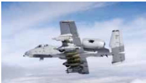
US Air Forces attack plane at action course

Iraqi Prime Minister Haider al-Abadi had repeatedly stated that as well. However, for a long time it was not possible to agree which forces would participate in the battle for Mosul and, most importantly, how the city would be governed after its liberation. It was a key issue. The control over Mosul means control over the dams on the Tigris and, therefore, over the water reserves of this river, transport routes, pipelines, and hydrocarbon reserves around it.