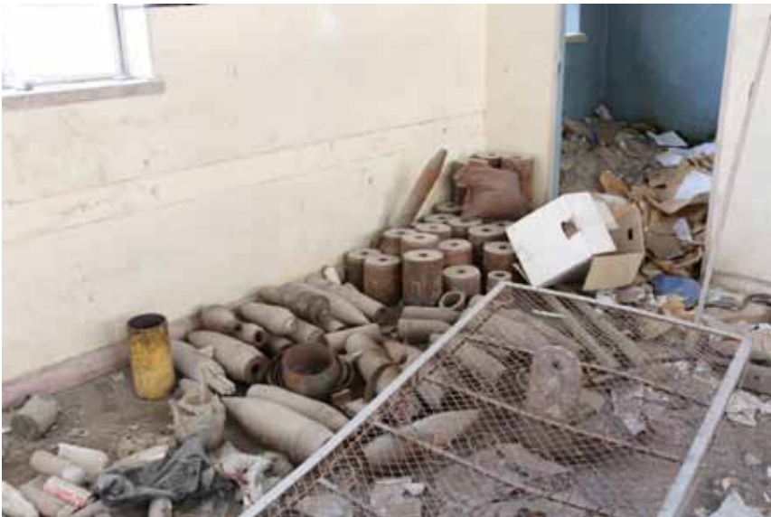
Improvised explosive devices workshop.