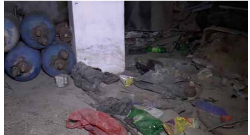
Trip-wire in a residential house in the historic area of Aleppo city.