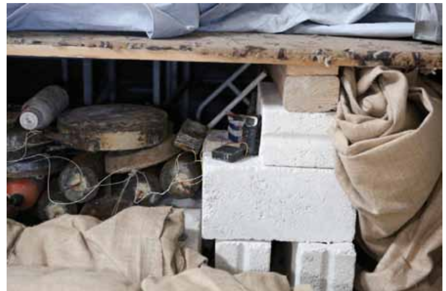
Remote-controlled improvised high-yield explosive device.