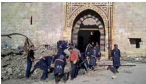
Recovery efforts in Aleppo

Unlike Aleppo, during the Mosul operation, foreign journalists were given only filtered information from the relevant press services and were not allowed into the combat area. The Iraqi army and coalition forces were engaged exclusively in conducting military operations. The facts of their participation in providing humanitarian aid to the population, as the Russian military did and still do in Syria, have not been revealed yet. Unlike Aleppo, where this work was launched by the Russian military, and then continued in cooperation with the United Nations and other international humanitarian missions, in Mosul this work was and is done by the United Nations agencies and other international organizations only.