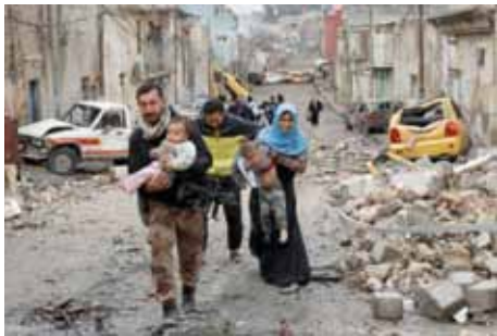
Mosul residents fleeing from combat operations area

- The DAESH militants in the "July 17" and "Wadi Akkab" areas erect earth walls and obstruct the movement of civilians using them as a human shield. At the crossroads in the "Maash Bazaar" and Yarmuk areas, militants set fire to oil tankers with heavy oil fractions trying to hide their positions from airborne surveillance and precision air strikes.