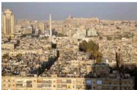
Aleppo before the war.

The Syrian city of Aleppo and the Iraqi city of Mosul became a symbol of the tragedy of hundreds of thousands of people and the barbarism of the 21st century. For several years, the names of these cities have been intrenching their positions in the global information space.