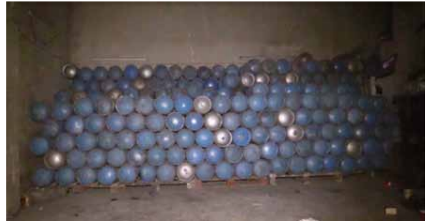
Cylinders depot in a school basement.