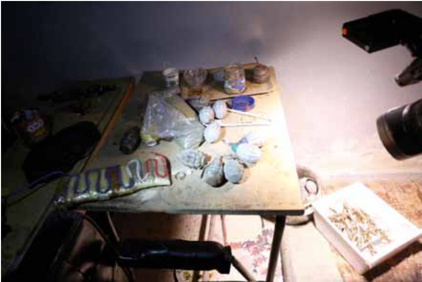
School quarters re-equipped for explosive belts manufacture.