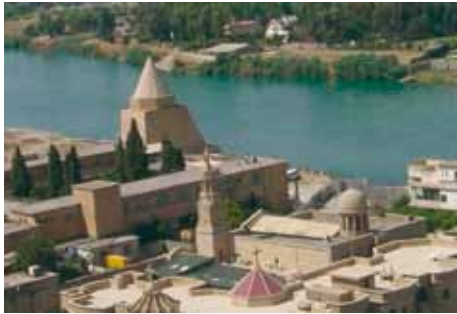
Mosul before the war

The liberation of the eastern Aleppo took a protracted nature. The proximity of Turkey enabled constant supply of the militants with weapons, ammunition and food. Nevertheless, on December 15, 2016, Aleppo, after the furious battles, was completely liberated from terrorists.