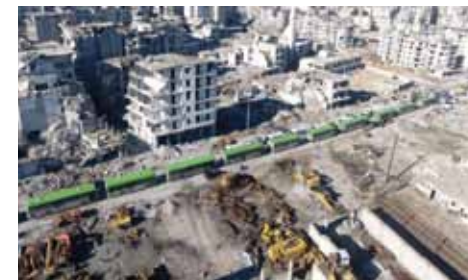
Buses near humanitarian corridors.

According to the data confirmed by the United Nations, about 100,000 people left eastern Aleppo through the humanitarian corridors. About 30,000 of them left for Turkey and Idlib province controlled by jihadists, while the rest remained in the territory controlled by the Syrian government. As of the first ten days of May 2017, 14,949 families (65,661 people, including 38,578 children) returned to Aleppo.