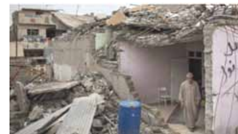
Mosul streets

The West considered the liberators of Aleppo as bad ones, without exceptions, and the radicals and Al-Qaeda adherents were good ones. They were willingly or unwillingly assisted by rather competent and well-known persons. For example, Tarja Halonen, the ex-president of Finland, said on October 27, 2016 in her speech at the meeting of the Valdai international discussion club in Sochi that the Finnish church held a mass memorial bell-ringing ceremony in memory of the victims of the Syrian Aleppo "bombing", but did not name the true perpetrators of the tragedy. She urged the churches around the world to follow the example of Finland.