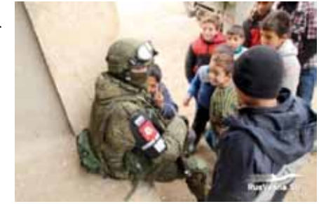
Serviceman of Russian military police with children from Aleppo

The Russian militaries played a significant role in the return of water supply to Aleppo. Its inhabitants were sorely lacking water. The pumping stations on the Euphrates River turned out to be in the hands of extremists, who used water against civilians in retaliation for defeat in combat, which was also noted by the UN and several international organizations 1 .