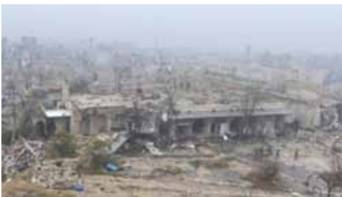
Aleppo in 2016.

During the civil war, a little more than a half of Aleppo was occupied by militants of various terrorist groups – followers of the Al-Qaeda ideology – and assimilated with them so-called 'moderate opposition' detachments and criminal gangs who looted, robbed and exacted the population. The longer this part of the city was in the hands of bandits, the