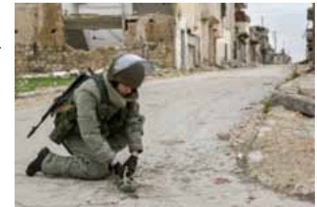
Russian sapper at work on Aleppo street.

In the eastern part of the city, our sappers alone cleared more than three thousand hectares of land, more than a thousand kilometers of roads, about five thousand residential buildings and social facilities, including municipal institutions, schools, mosques, kindergartens and hospitals. In total, the Russian specialists in eastern Aleppo disarmed 40,000 explosive items, including more than 20,000 improvised explosive devices (Annex No. 3).