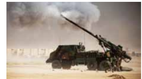
Multiple launch rocket system firing Mosul

In mid-February 2017, the Iraqi Prime Minister Haider al-Abadi announced the beginning of an operation to liberate the western part of the city. The battles dragged out. According to Lieutenant General Talib Shahati, commander of the anti-terror units of the Iraqi army’s Mosul grouping, the losses among his personnel alone totaled at least 50 per cent of the military personnel.