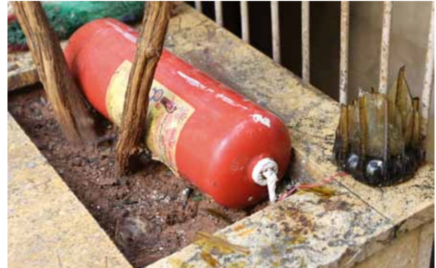
Blast mine disguised as a fire extinguisher.