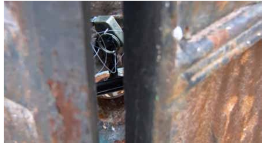
Anti-handling blast mine activated by hand grenade fuse assembly.