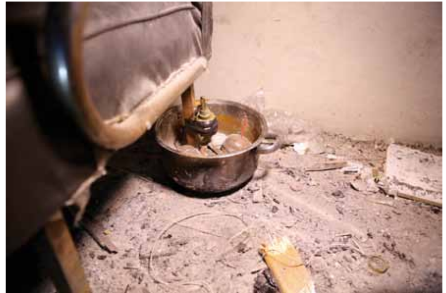
Hand grenade attached to the armchair leg enhanced with improvised explosive devices.