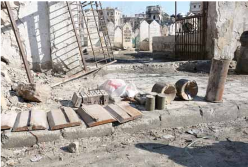
Improvised high-explosive shells for various purposes found in a grave.