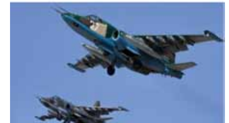
Su-25 attack planes of the Russian Aerospace Forces on combat mission

Russian military specialists made a substantial contribution in reversing the situation on the front line. They were sent almost to all troops of the government army, down to battalions. Without substituting Syrian commanders, Russian military specialists assisted them in organizing reconnaissance, operations command and control, and comprehensive force sustainment. Even the first surgical airstrikes of the Russian Aerospace Forces improved the combativity of the Syrian military, allowed them to switch from passive defensive fighting to offensive in several directions at once. Almost all operations conducted by government forces in Aleppo, Palmira, Latakia mountains, Daraa and Damascus provinces were planned, prepared and implemented under the guidance of the Russian military advisers.