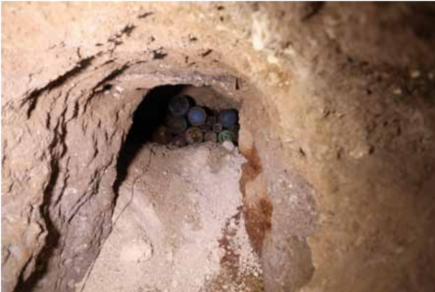
Ammunition pack prepared for explosion in a tunnel under a street in the historic area of Aleppo city.