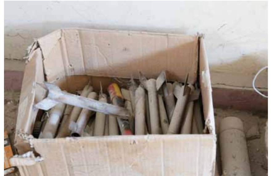
Ammunition depot in a classroom.