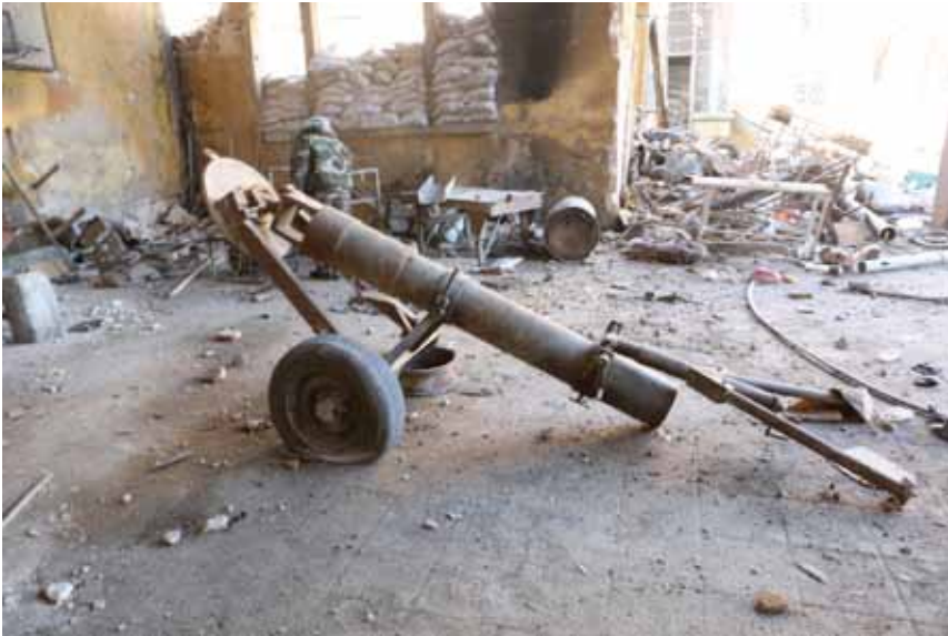
“Hellfire” system in a school quarter.