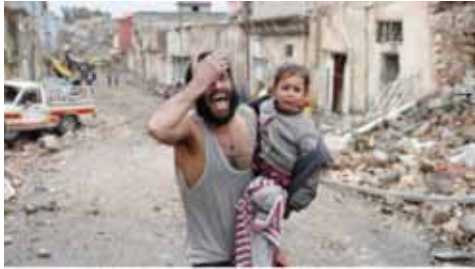
Streets of Mosul.

sniper, along with six other militants of his unit and destruction of a car with a machine gun mount. The houses of local residents were also in the area of the air strike. There is no information about the victims among them.