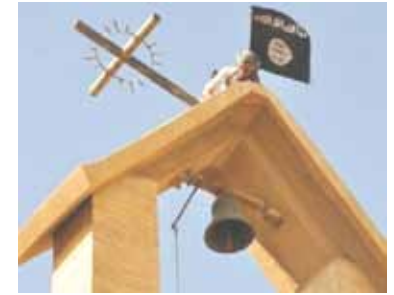
Mosul before the war

These are, perhaps, some similarities of the cities' tragedies.