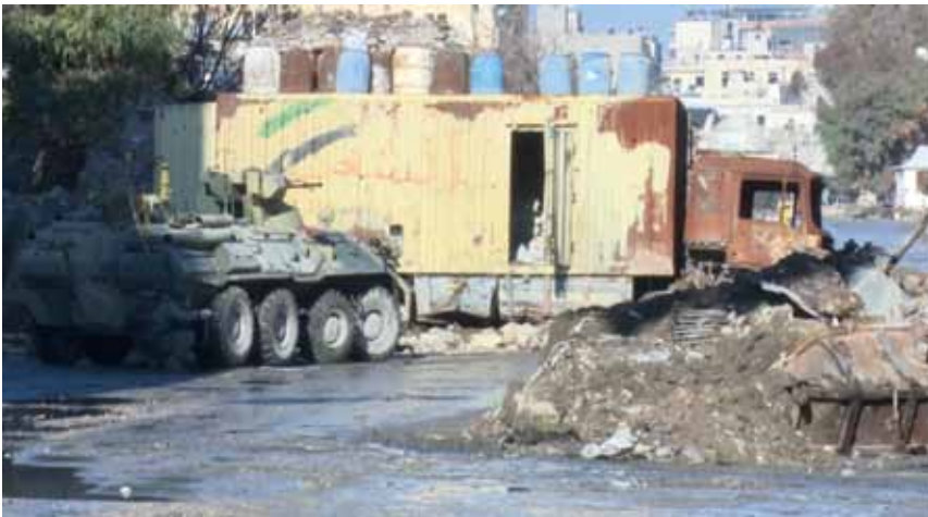
Combat engineer team demining a 'jihad car' in Al-Aqabah district.